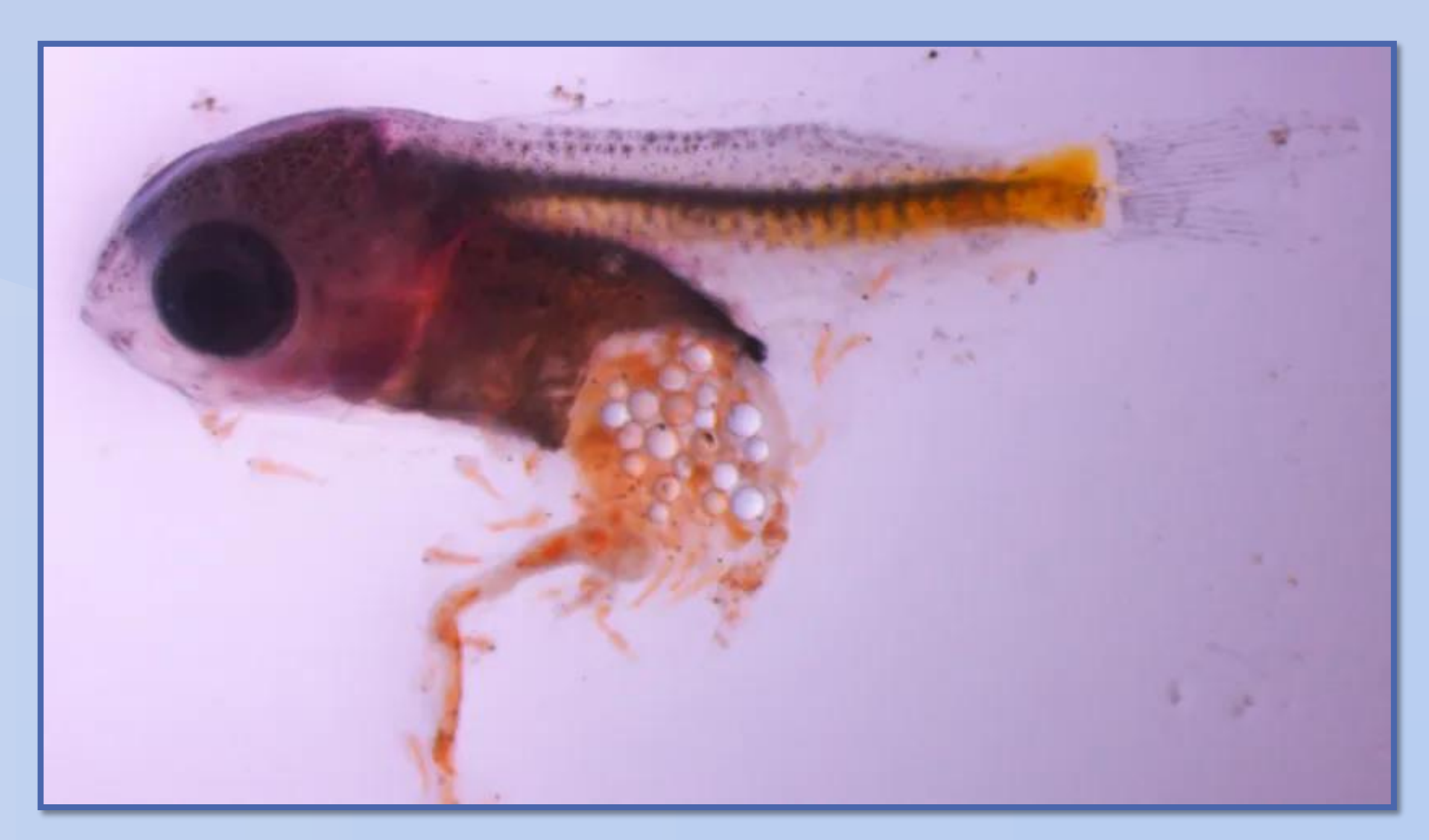
Figure 3: Damselfish larvae that has ingested microplastics (Image Credit: Oona M. Lönnstedt, 2016).

Another pollutant and risk to marine life are the microplastics –tiny particles of plastic less than 5mm in length– that are shed by synthetic fibers. Fast fashion accounts for 35% of all microplastics found in the ocean (Shulka, 2002). These microplastics are swallowed by marine life, which were observed to accumulate in their digestive tract and inhibit their growth (Li et. al., 2021) (Figure 3). When these microplastics are absorbed, they can have toxic effects on marine life: in one study, fertility decreased due to lowered ovulation rate and sperm mobility, and white bloods cells were damaged which resulted in immunodeficiency (Li et. al., 2021). This could potentially lead to reduced numbers of marine populations.