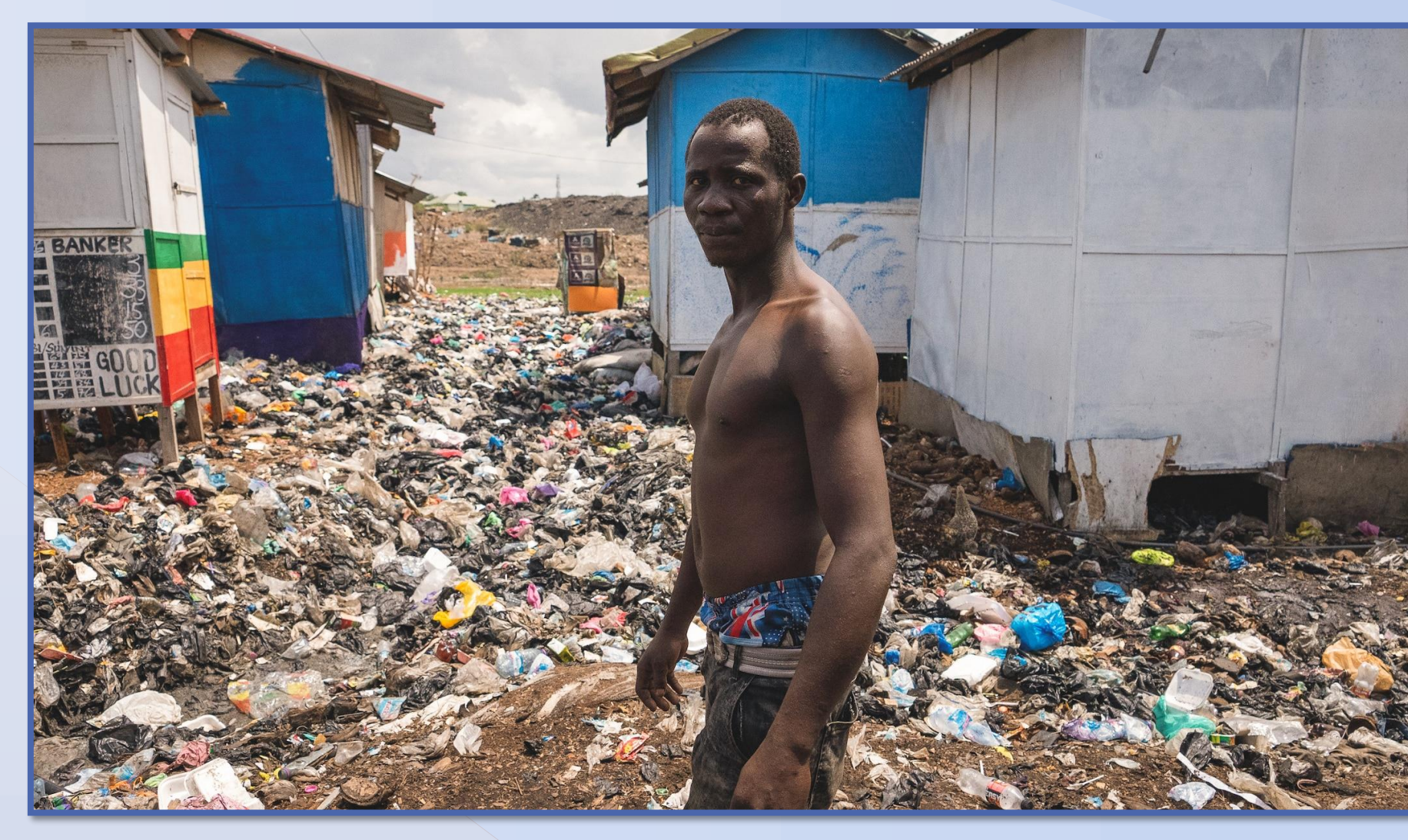
Figure 2: A man standing among discarded clothing in Accra, Ghana.

Donation isn't always a more environmentally-friendly option either. Garments are sent to Ghana in West Africa to be resold, however, out of the 15 million articles that its capital Accra receives weekly, approximately 40% will be dumped in local landfills or burned due to being of such low quality that they cannot be resold (Besser, 2021).