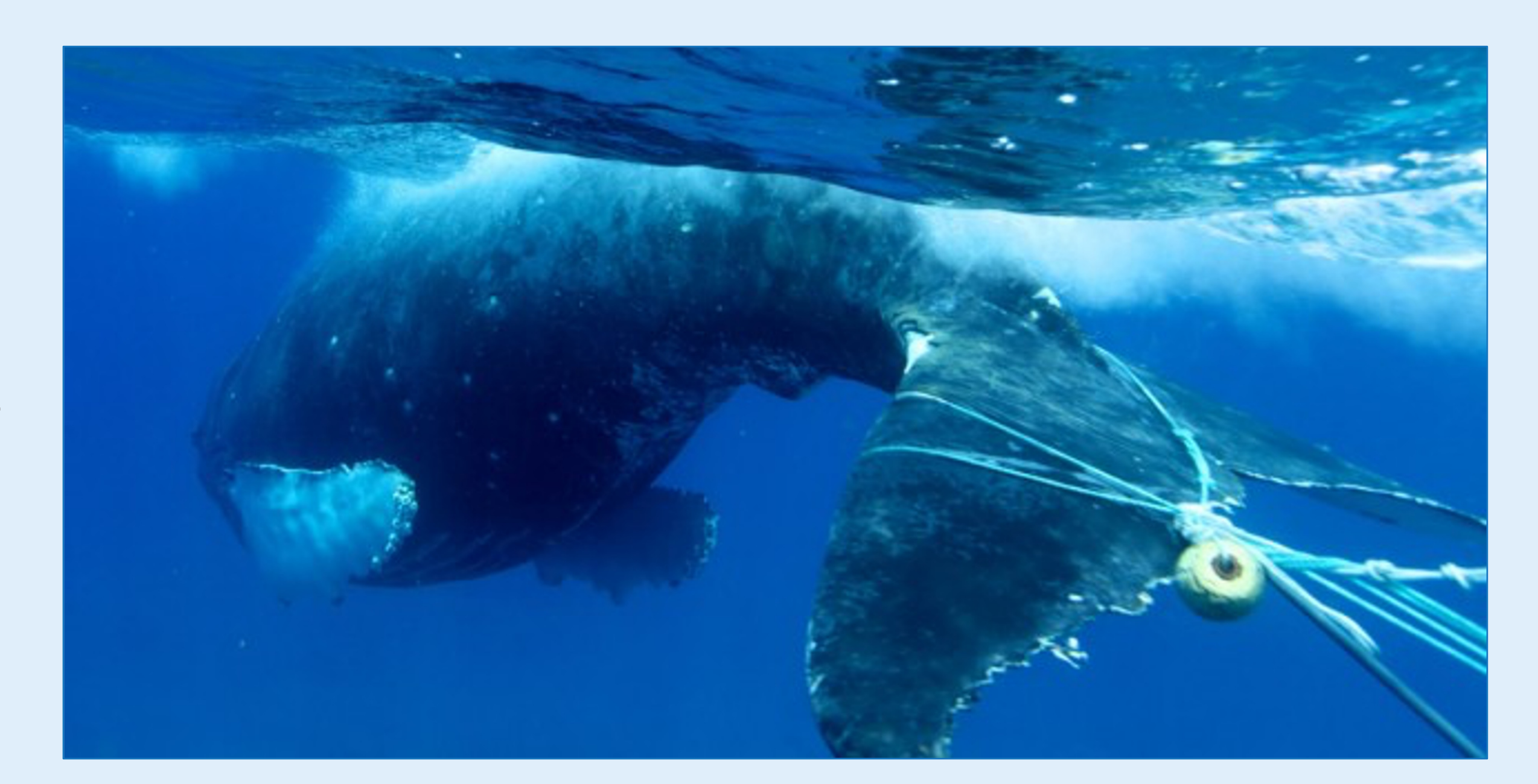
Figure 3 - A humpback whale trapped in fishing gear.