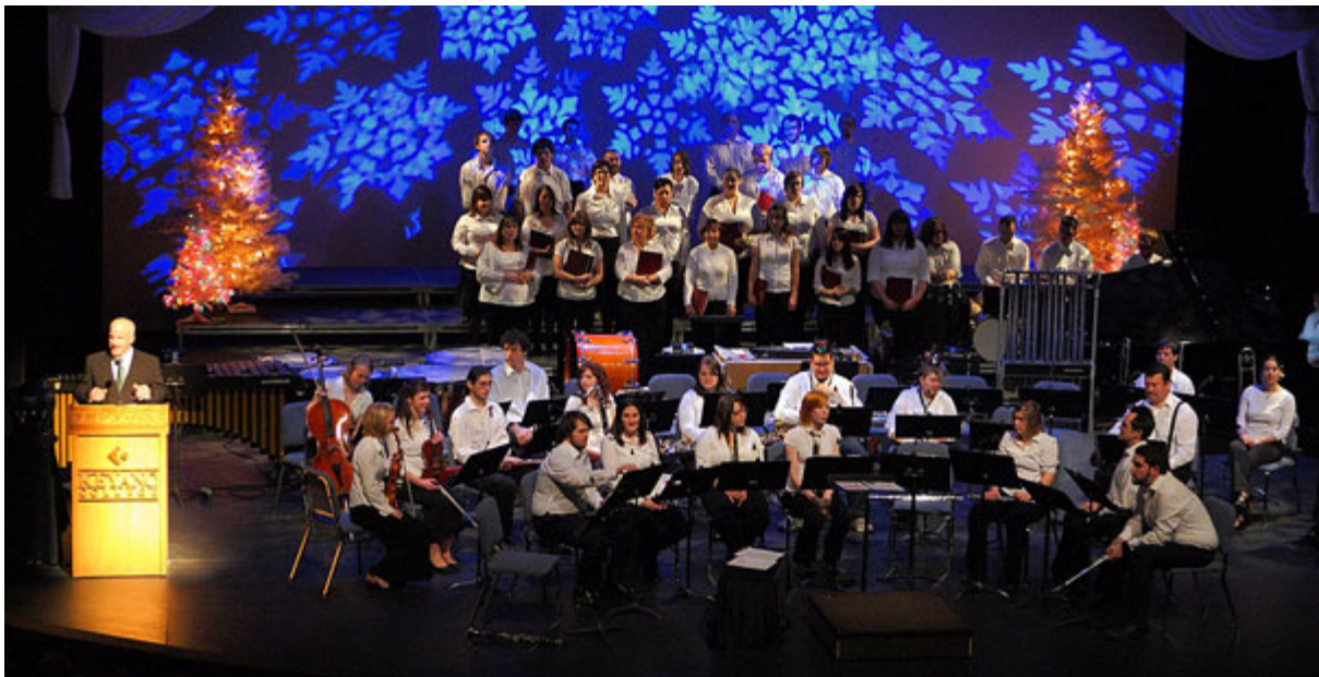
Visual & Performing Arts students and faculty at the concert.

As the nearly 600 patrons made their way home in the blowing wind and snow, they were able to get a glimpse at The Lights of Christmas , the display featuring 200,000 lights animated to music that was turned on earlier that day.